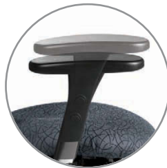
Armcap moves up and down

Tritek™ Ergo-Select comes with the ultimate adjustable G3 and G2 arms. Movement in five directions allows easy adjustment for most users and their tasks.