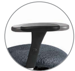
Armcap slides forwards and back