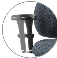
Armcap slides away from seat (WA)