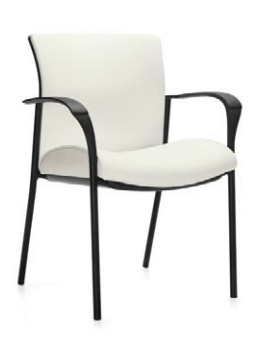
Side chair with upholstered back