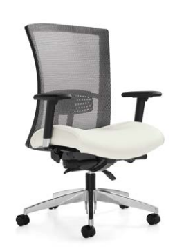
Task chair with mesh back