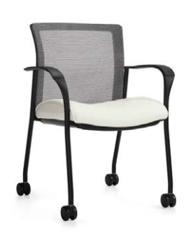
Side chair with mesh back and casters