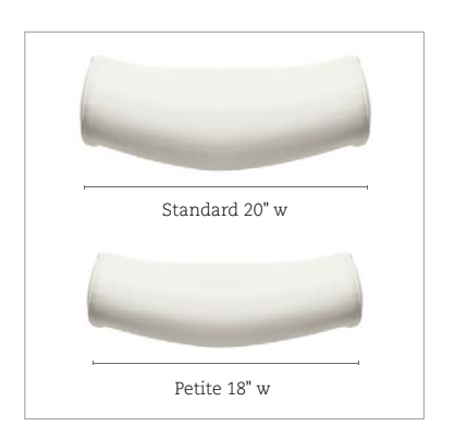
Petite seat option