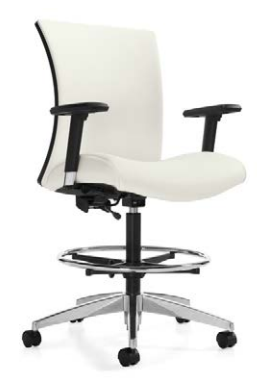
Drafting stool with upholstered back