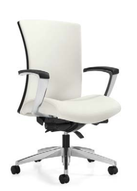
Meeting chair with upholstered back