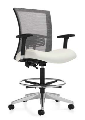
Drafting stool with mesh back