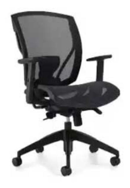
Mesh finishes excel in breathability, providing cool comfort and ergonomic support for extended use.